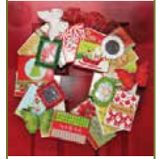
Reused Cards Wreath