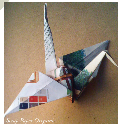
Scrap Paper Origami